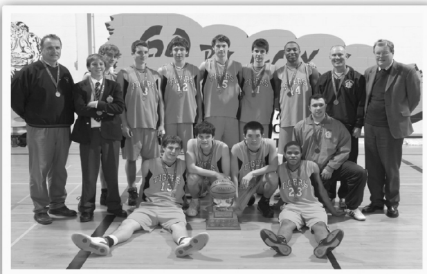
FIRST BOYS & GIRLS BASKETBALL TEAMS - 2008 CISAA CHAMPIONS